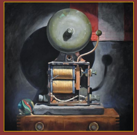
Alarm Bell (juried artwork), Oil on Canvas, 30" x 30"

Held at the California Center for the Arts, Escondido Museum. For more information and to see works in the show by these exhibiting artists, visit www.artcenter.org or call 760-839-4175.